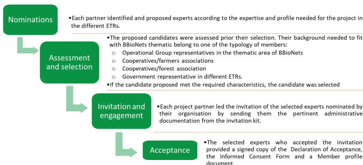
Figure 3. BBioNets Advisory Board creation process.